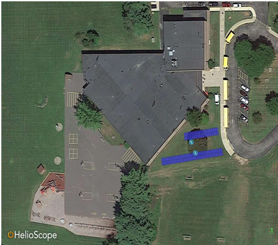
Diagram is an approximation

System Rating: 57.2 kW | Number of Panels: 106 | SolarOffset: 18%